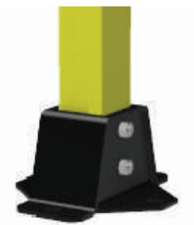
STRONG POST BASE STRUCTURE

Roldory sheet metal panels are used in welding applications and applications where there is a risk of liquid splash. Roldory sheet panels are very durable due to the support of 1.5 mm thick sheet steel with a 20x20 mm profile frame. Transparent, colored polycarbonate or plexi viewing windows can be added to the panels. Special red transparent plexies are used to prevent harmful UV rays in welded manufacturing areas. Observation windows can be made on request besides standard dimensions. The observation windows are connected to the panel with gasket without using any bolts.