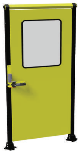
Hinged Doors Single Hinged Door 500-1000mm Double Hinged Door 1000-2000mm