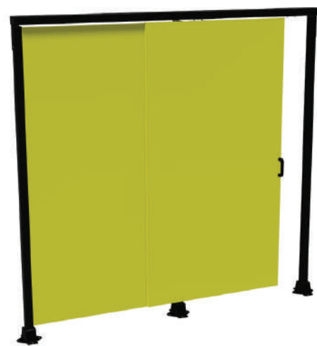
Sliding Doors 500-1000mm

Door Lock Options: Standart lock is magnetic lock. Also door can be prepared according to preferred lock. (Euhcner, Pizzato, Pilz etc.)