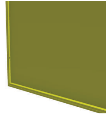
BENDED SHEET IS WELDED ON PROFILE FRAME