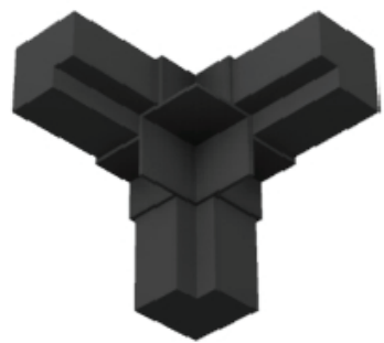
CORNER CONNECTING PART

These modular cabins are suitable for use in many areas of the industry. Therefore, instead of welded constructions, it is a fast, durable, economical cabinet solution to install. From the observation window to the vent, all details are available. The cabin can be assembled by the Roldory team or you can get the price advantage by assembling it yourself.