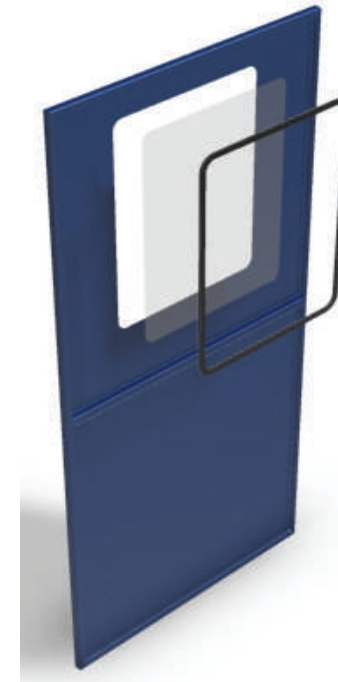
OBSERVATION WINDOW PANEL Polycarbonate or plexi is used. Assembled with gasket.