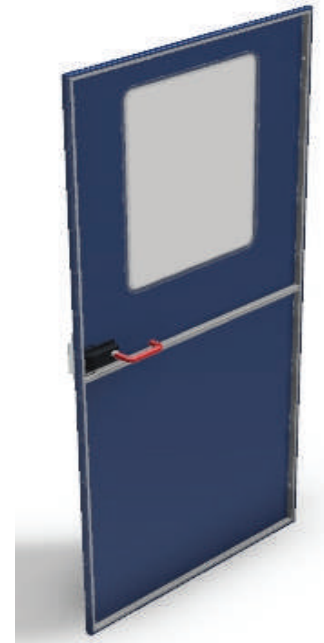
DOOR Supported With 20x20mm profiles.

These modular cabins are suitable for use in many areas of the industry. Therefore, instead of welded constructions, it is a fast, durable, economical cabinet solution to install. From the observation window to the vent, all details are available. The cabin can be assembled by the Roldory team or you can get the price advantage by assembling it yourself.